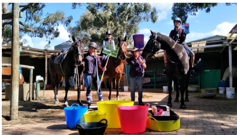
EVO Lifestyle Products